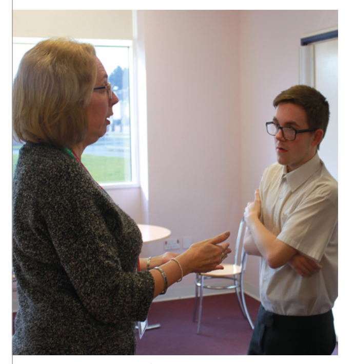
A careers lesson at Catcote Academy

In addition, we offer a range of in-house opportunities to boost our students' confidence in the workplace and to develop their employability skills within the following areas: reception duties, horticulture, grounds maintenance, ICT, admin, hair and beauty, enterprise, reprographics, hospitality and catering and classroom support.