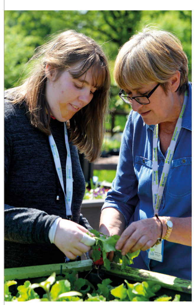
Student from Royal School Manchester learning about horticulture