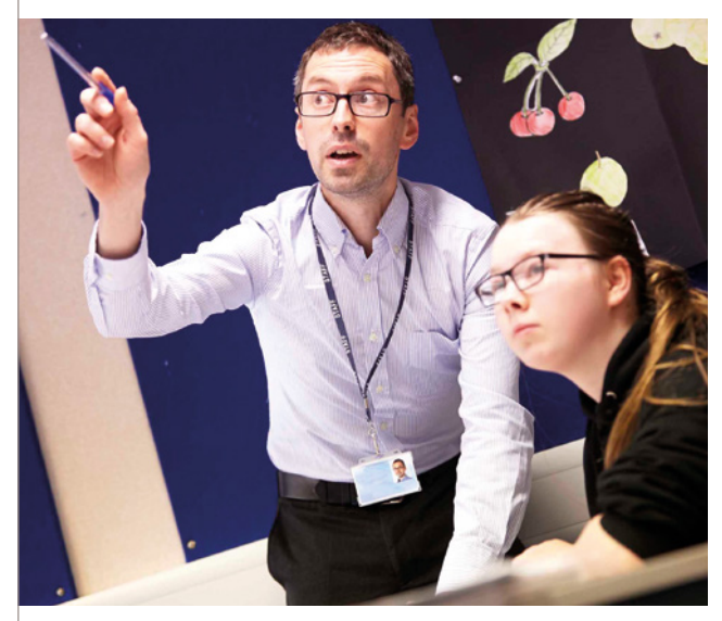
An employability lesson at Derwentside College

In summary, as a college we have found that the combination of extra time spent with learners with SEND, investing in staff with extensive SEND experience and adapting and creating careers resources specifically for learners with SEND has helped us to meet the needs of all of our learners in the college as they progress into the world of work.