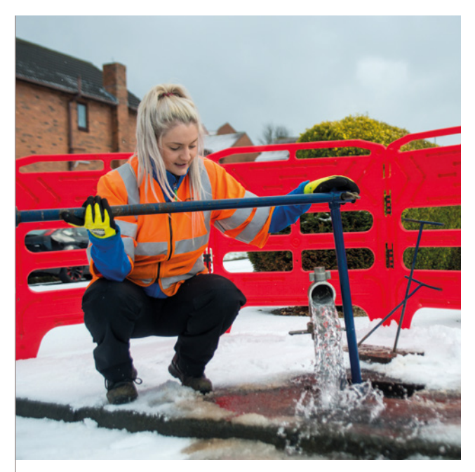
Northumbrian Water employee at work

schools need from an employer, what works and what doesn't. I also wanted to learn how to achieve better long-term outcomes when we welcome those with different needs into our workplace.