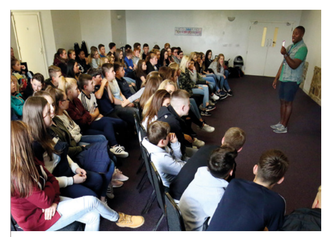
External speaker working with students from St Joseph's Catholic Academy

In our sixth form we have a student whose goal has always been to go to university. Due to her physical disability she uses a wheelchair, and is unable to write or carry out many tasks other students take for granted. She had always attended specialist provision but during her GCSE years she was proactive in getting in touch with local schools that could offer A-levels. However, although she had no learning difficulties, there was a clear gap in provision in our local area for students with these types of physical disability. I felt that we could meet the needs of this student,